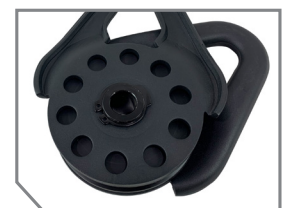
HEAVY-DUTY FORGED STEEL CONSTRUCTION