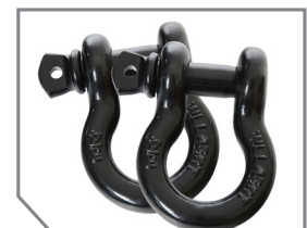
AVAILABLE IN PAIRS