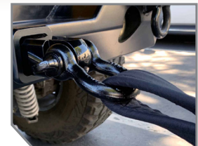
WORKS WITH OTHER RECOVERY GEAR