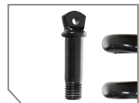
THREADED SHAFT FOR EASY INSTALLATION